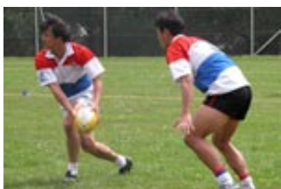
Training action with the Korean 7's team

Other concerns were the Korean's aerobic levels after testing, but we are delighted to say that the camp was successful in so much as the Korean team certainly established a structure which became more solid as the tournament went on and their confidence grew. Tries against New Zealand and Samoa were a new experience and they achieved victories over Niue and Papua New Guinea in the quarter final. In the semi final they were very competitive against the highly rated Argentina scoring 19 points.